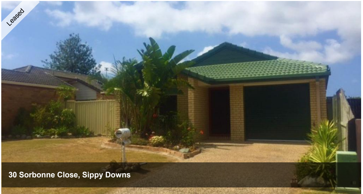
30 Sorbonne Close, Sippy Downs