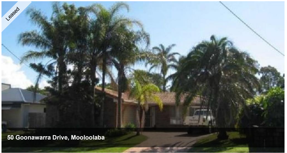
50 Goonawarra Drive, Mooloolaba