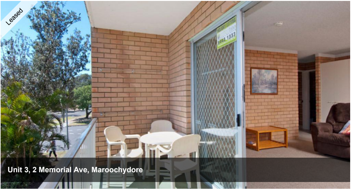
Unit 3, 2 Memorial Ave, Maroochydore