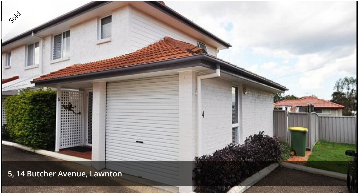
5, 14 Butcher Avenue, Lawnton