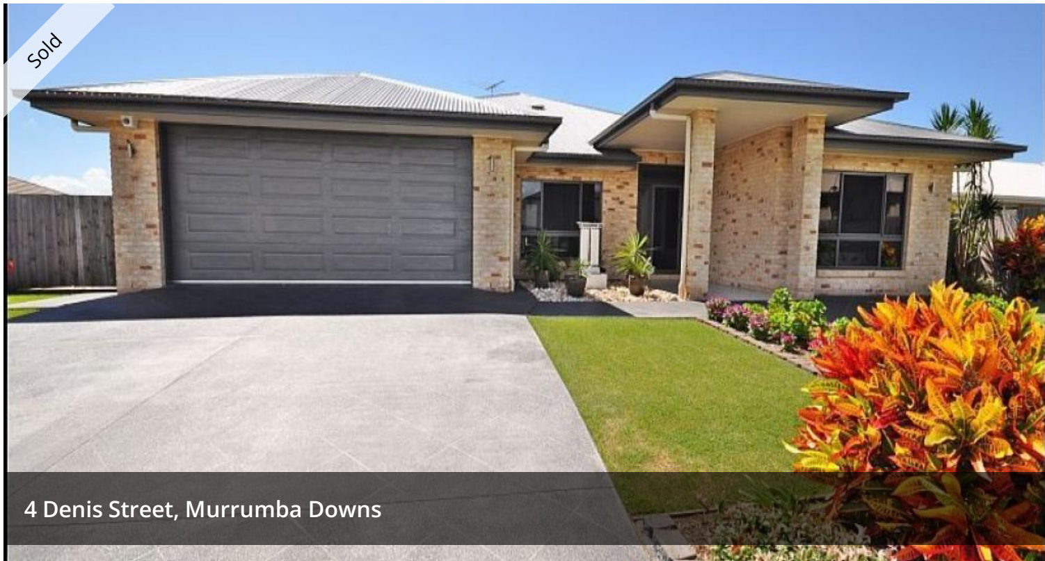
4 Denis Street, Murrumba Downs