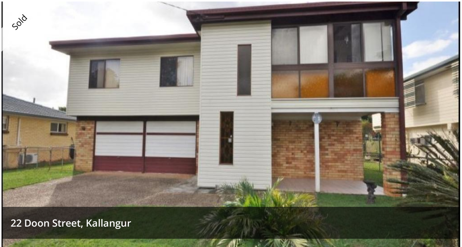
22 Doon Street, Kallangur