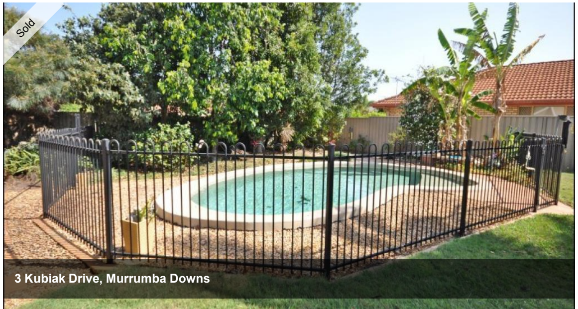
3 Kubiak Drive, Murrumba Downs