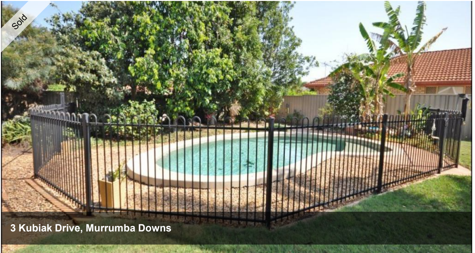
3 Kubiak Drive, Murrumba Downs