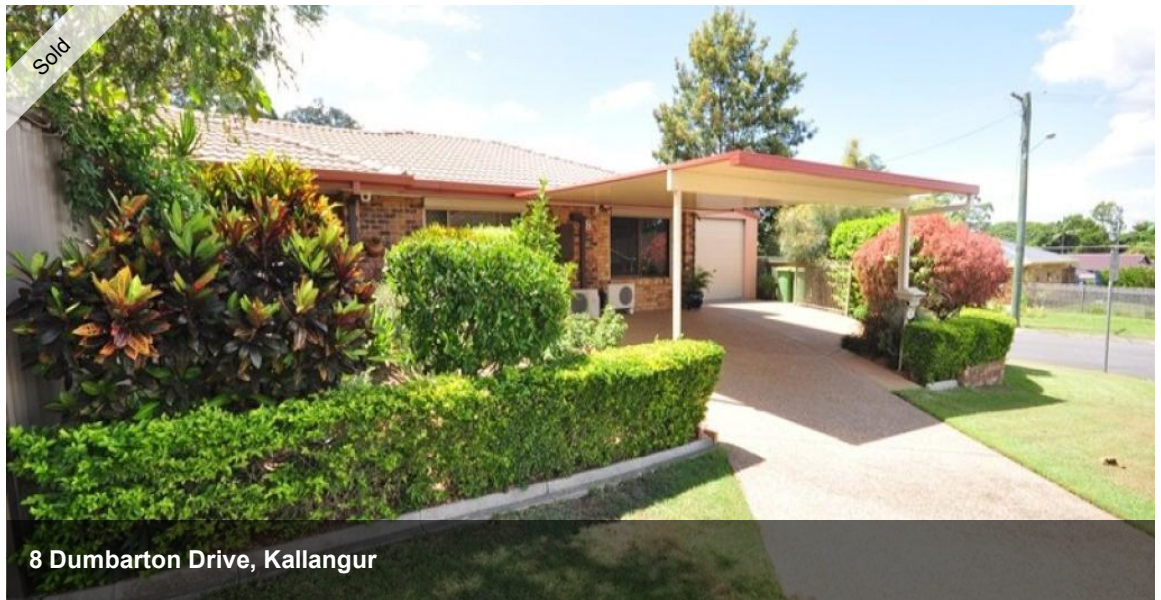
8 Dumbarton Drive, Kallangur