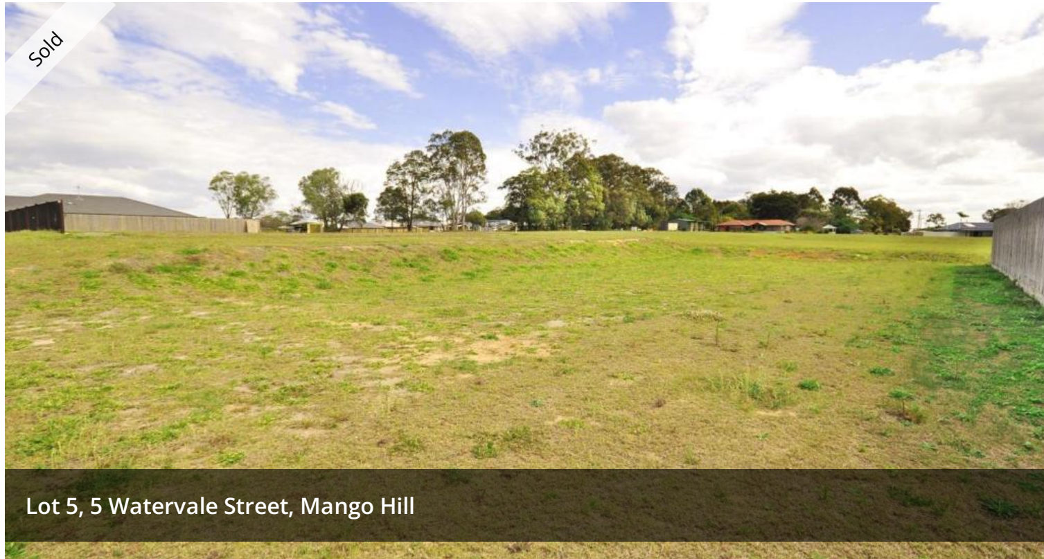
Lot 5, 5 Watervale Street, Mango Hill