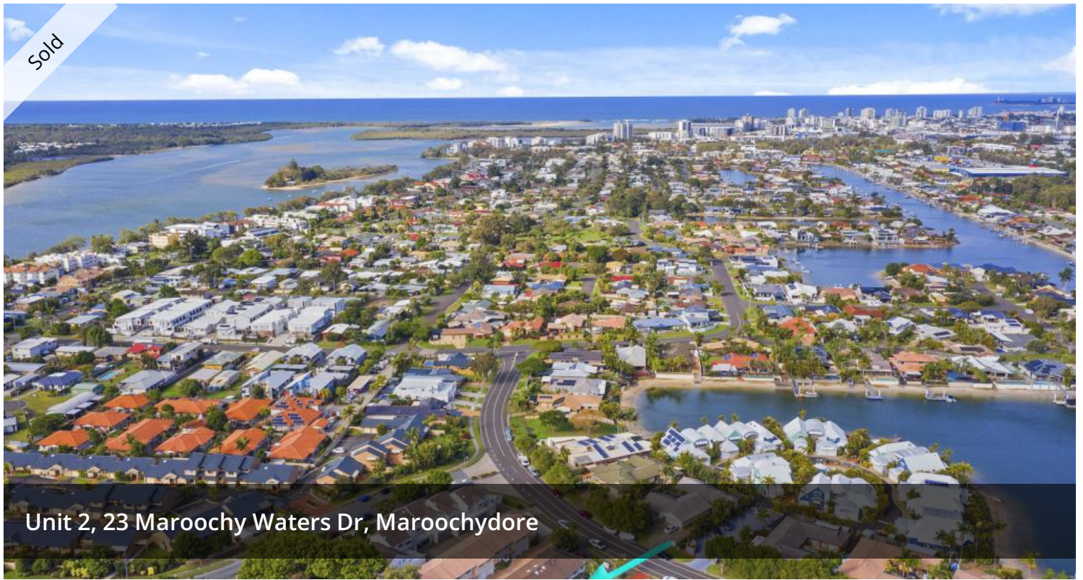
Unit 2, 23 Maroochy Waters Dr, Maroochydores