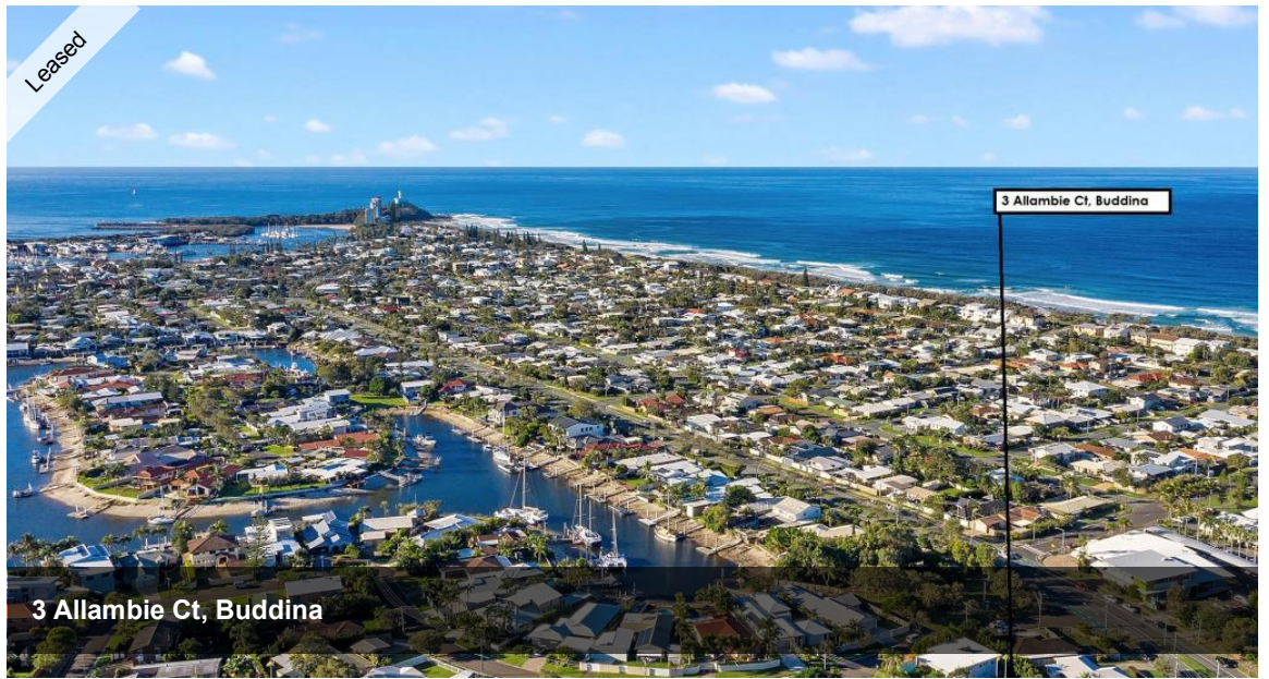
3 Allambie Ct, Buddina