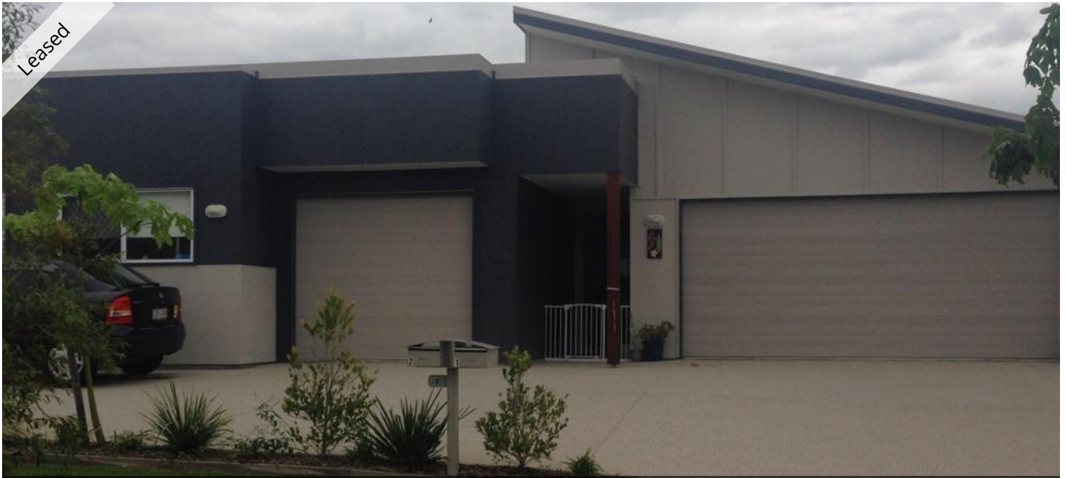
Unit 2, 28 Silver Wattle Gr, Peregian Springs