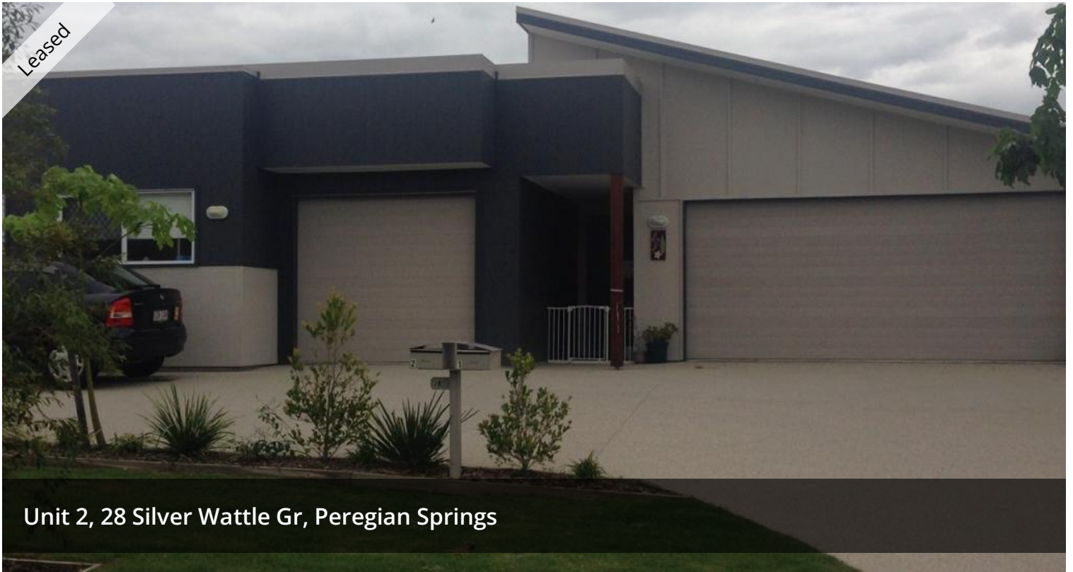
Unit 2, 28 Silver Wattle Gr, Peregian Springs