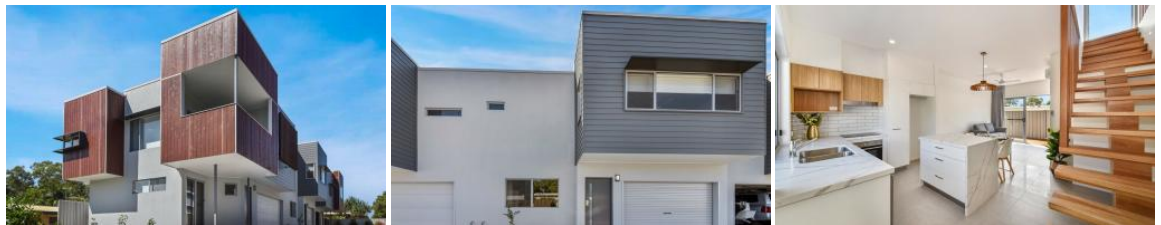
Unit 2, 11 Kenewin Ave, Maroochydore