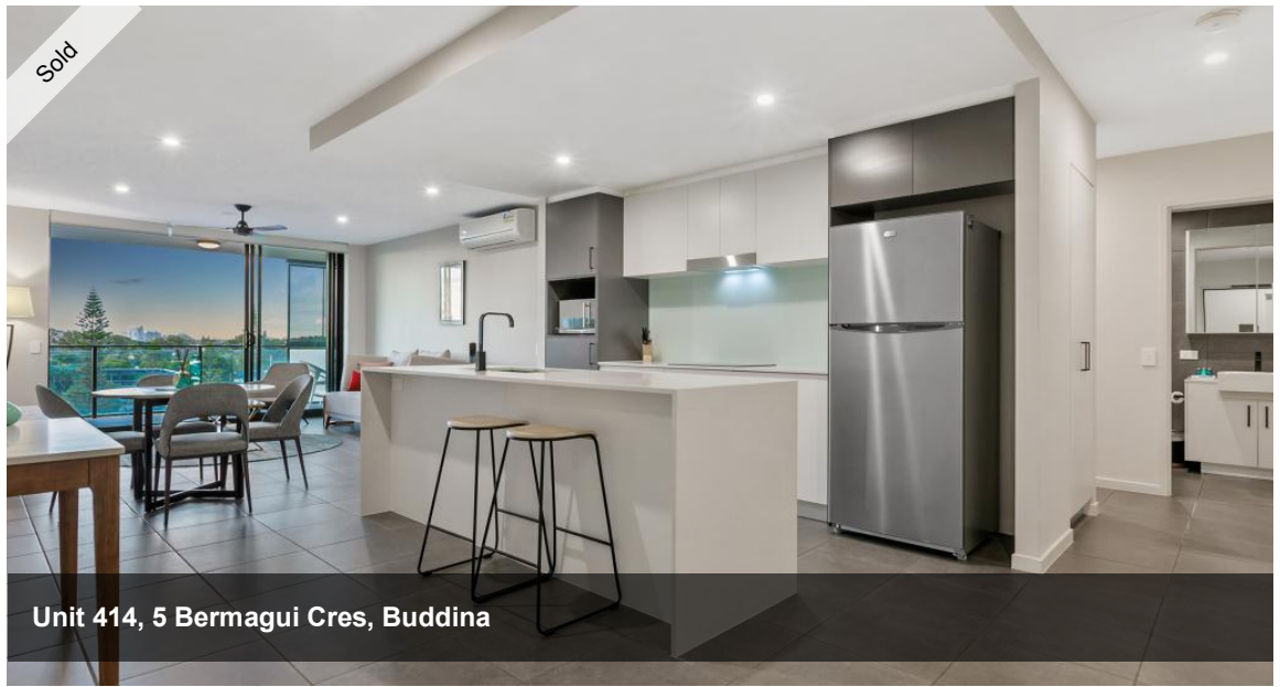
Unit 414, 5 Bermagui Cres, Buddina