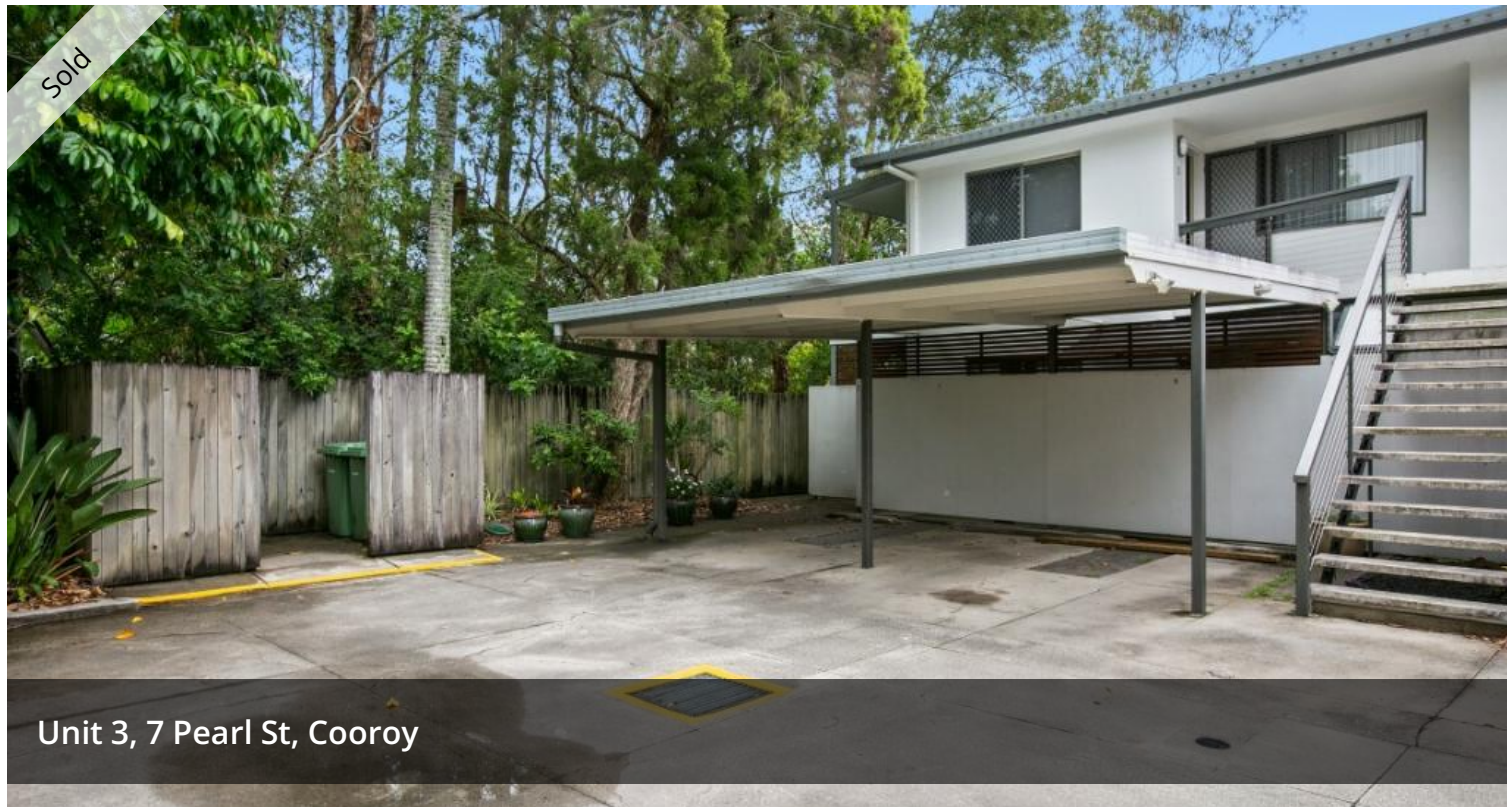
Unit 3, 7 Pearl St, Cooroy