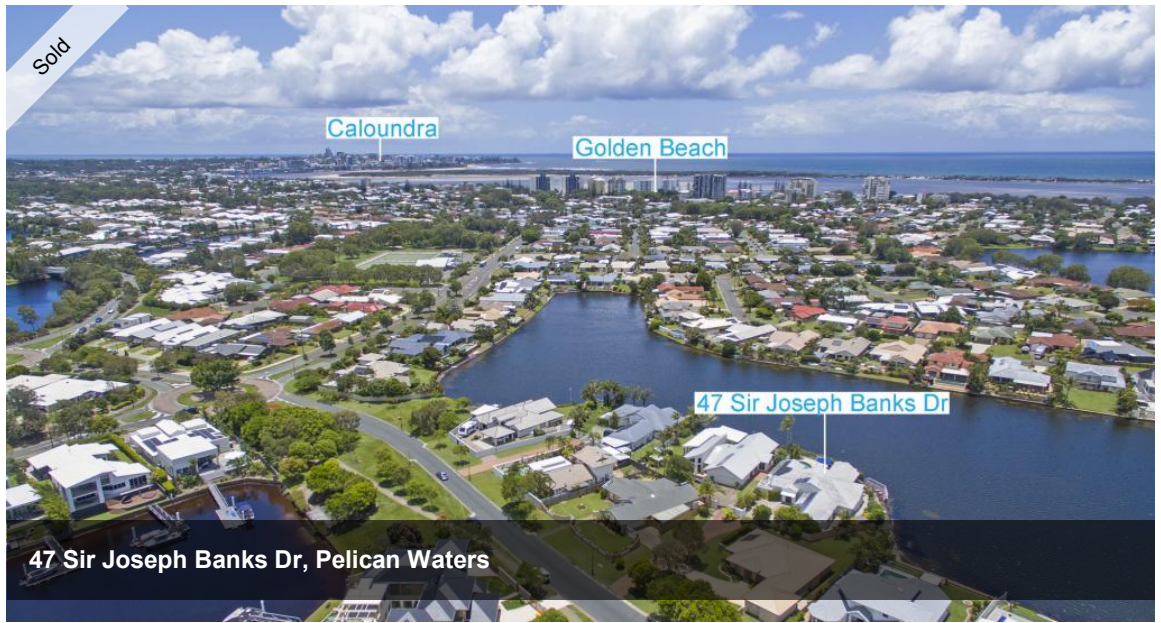
47 Sir Joseph Banks Dr, Pelican Waters