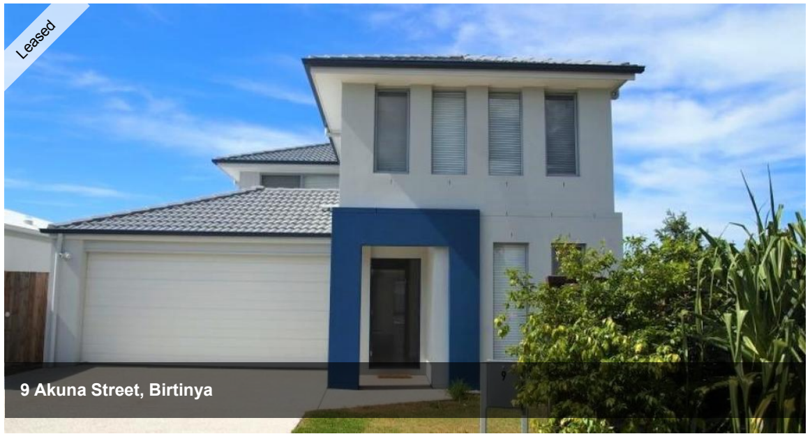
9 Akuna Street, Birtinya