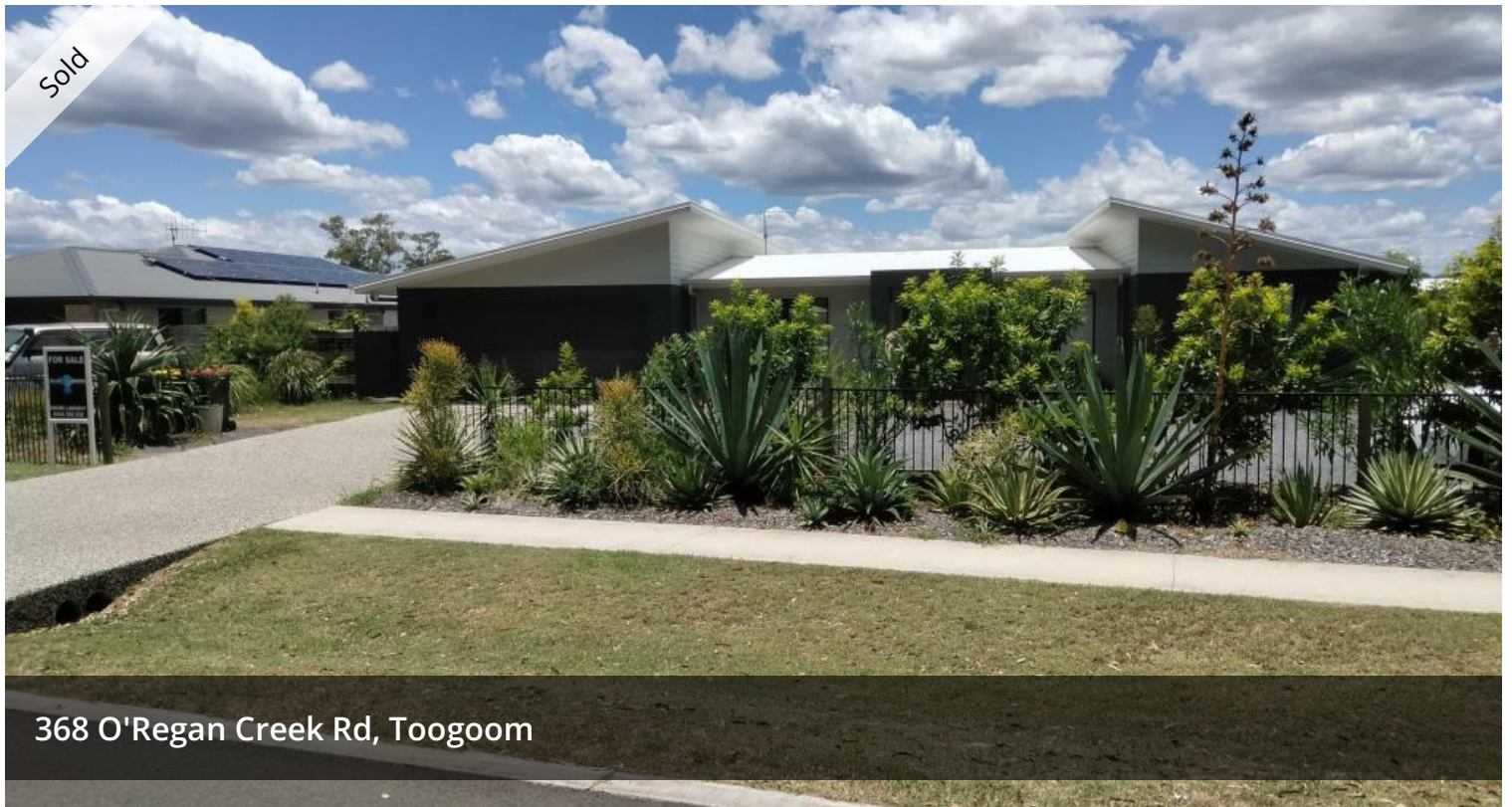
368 O'Regan Creek Rd, Toogoom