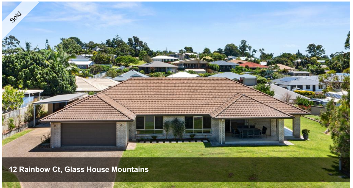
12 Rainbow Ct, Glass House Mountains