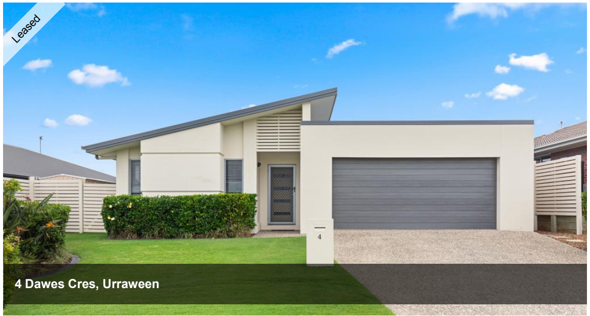
4 Dawes Cres, Urraween