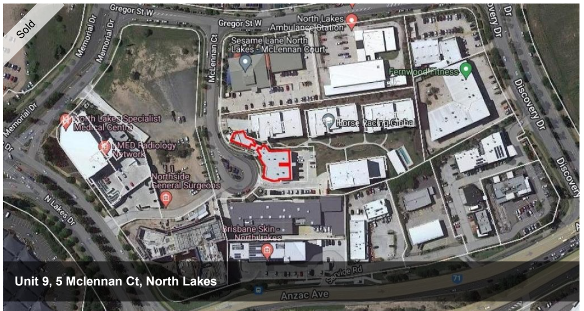
Unit 9, 5 McLennan Ct, North Lakes