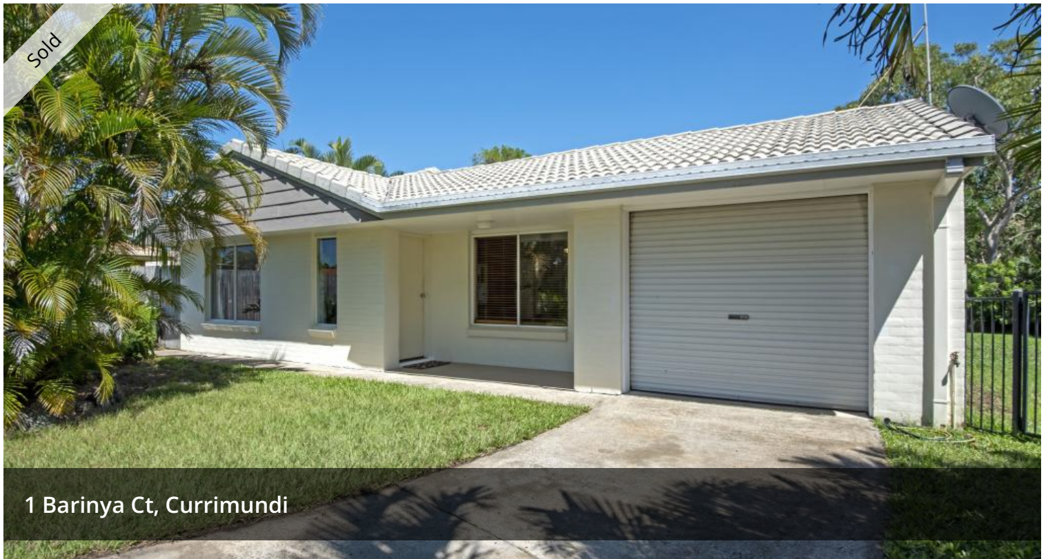
1 Barinya Ct, Currimundi