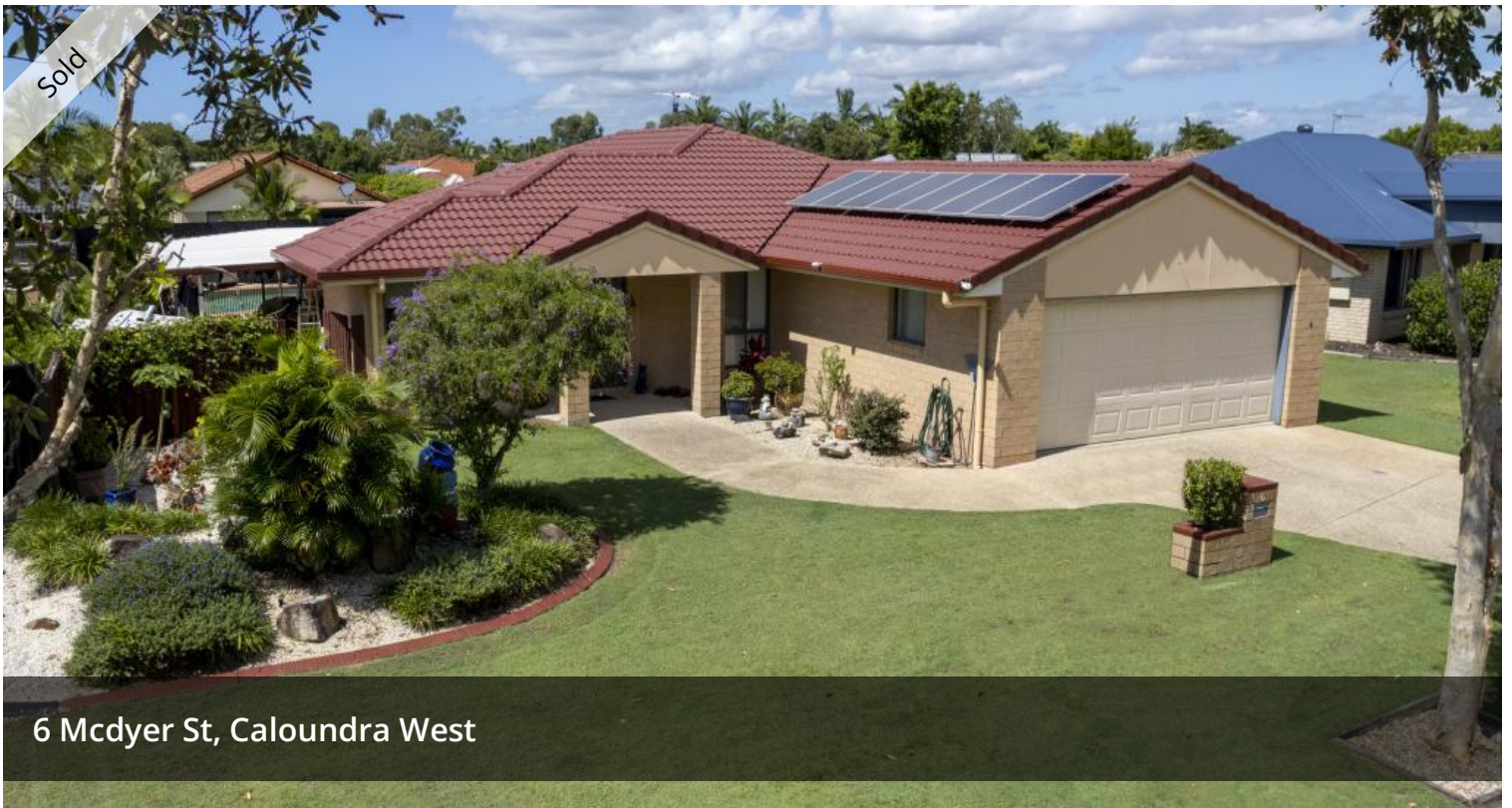
6 Mcdyer St, Caloundra West