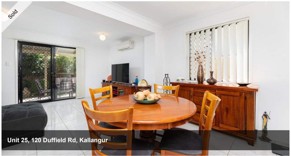
Unit 25, 120 Duffield Rd, Kallangur