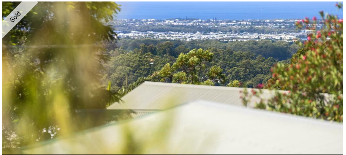
Unit 2, 61A Burnett St, Buderim