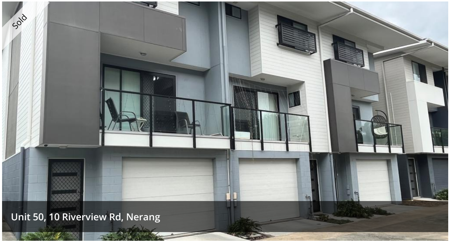
Unit 50, 10 Riverview Rd, Nerang