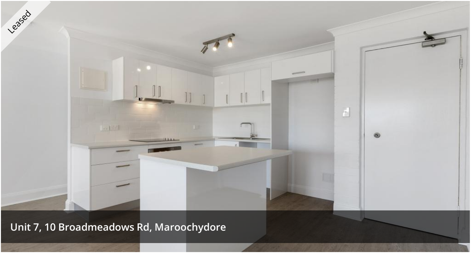
Unit 7, 10 Broadmeadows Rd, Maroochydore