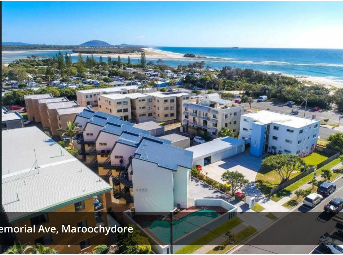
Unit 9, 6 Memorial Ave, Maroochydore