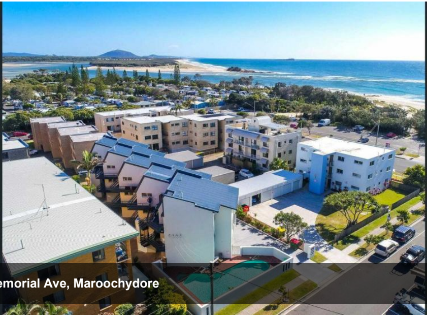
Unit 9, 6 Memorial Ave, Maroochydore