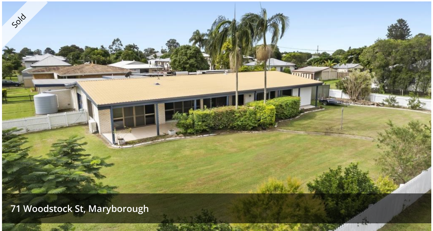
71 Woodstock St, Maryborough