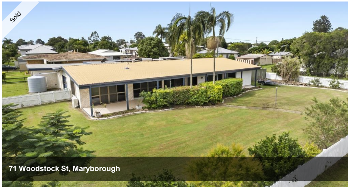
71 Woodstock St, Maryborough