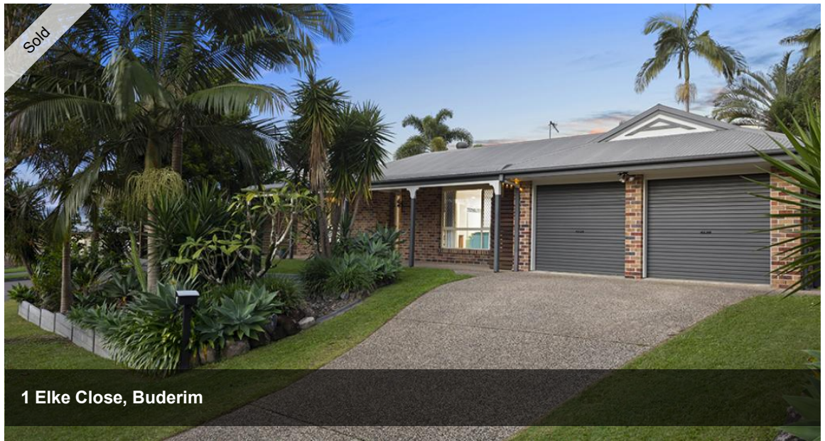
1 Elke Close, Buderim