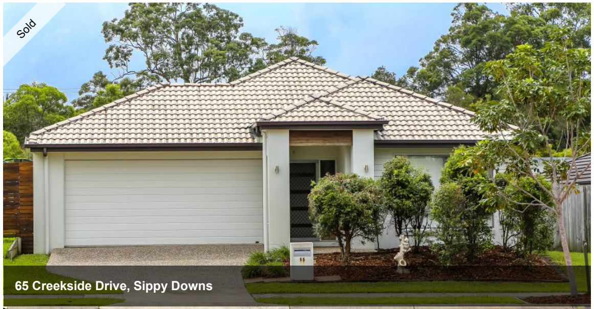
65 Creekside Drive, Sippy Downs