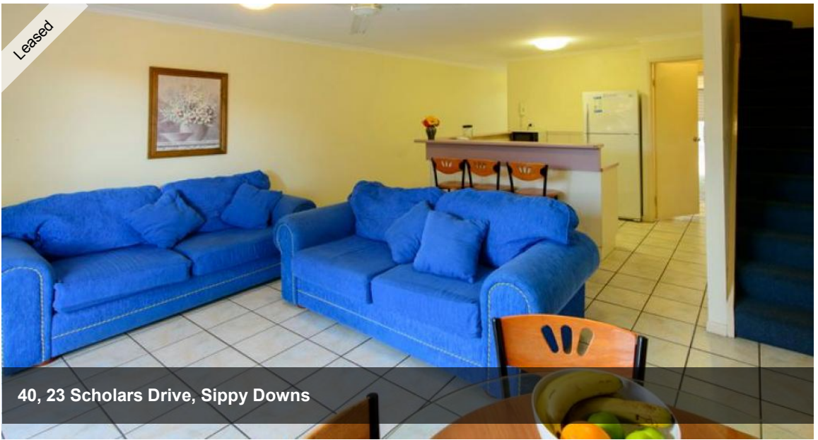
40, 23 Scholars Drive, Sippy Downs