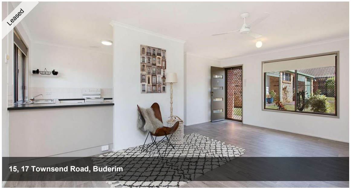
15, 17 Townsend Road, Buderim