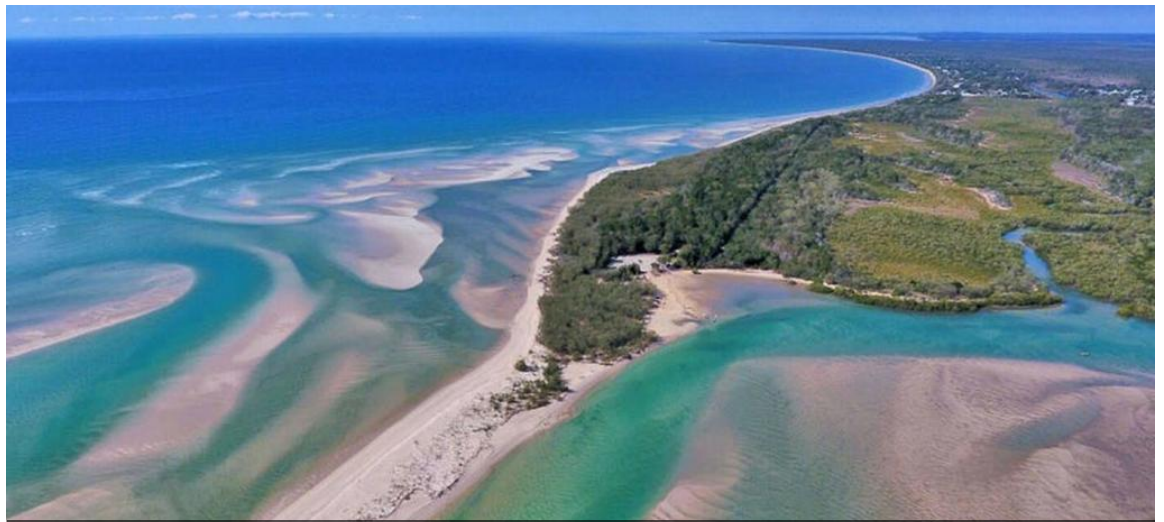
51 Ocean View Drive, Woodgate