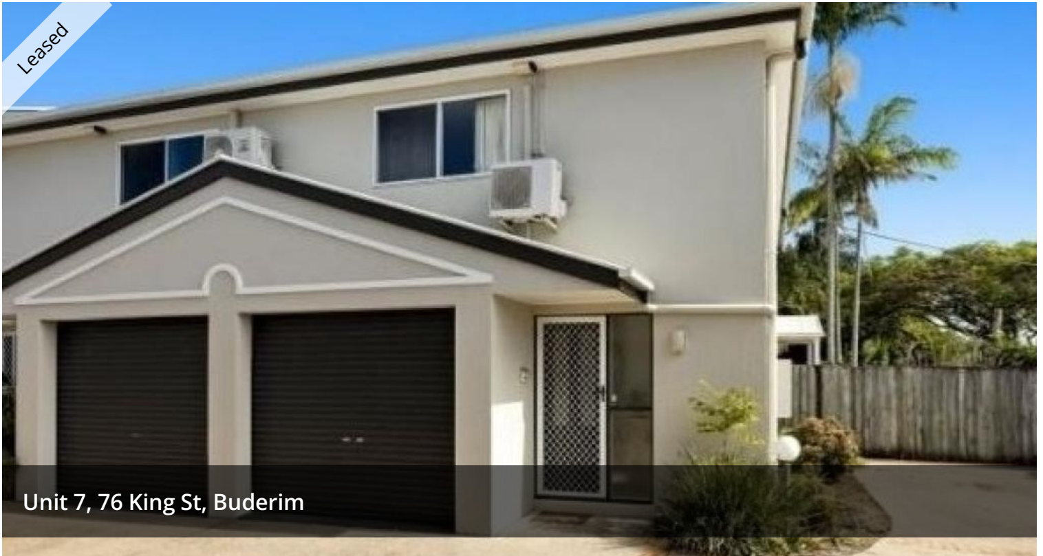
Unit 7, 76 King St, Buderim