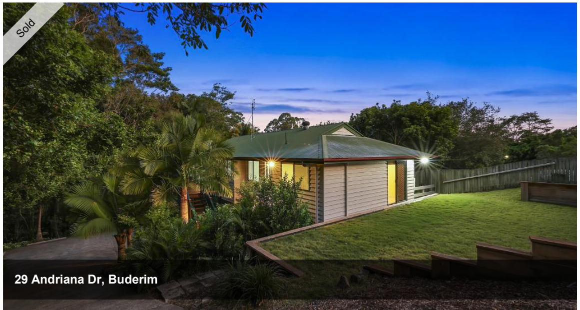
29 Andriana Dr, Buderim