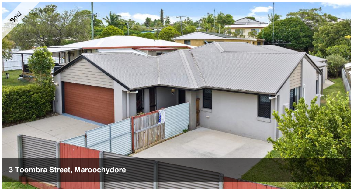
3 Toombra Street, Maroochydore