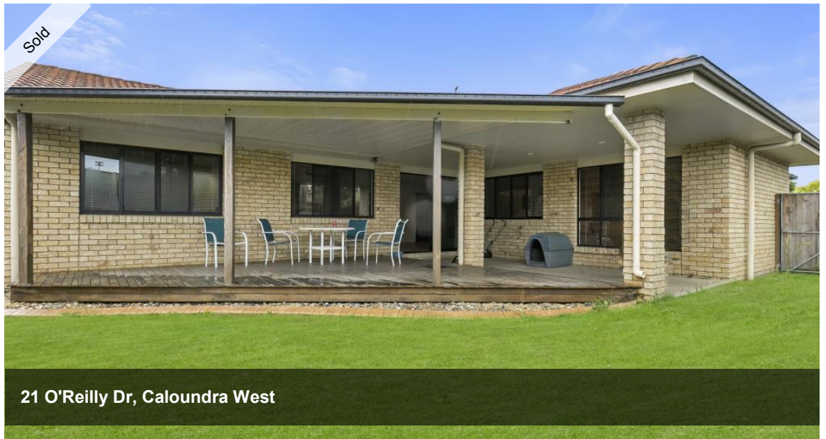
21 O'Reilly Dr, Caloundra West