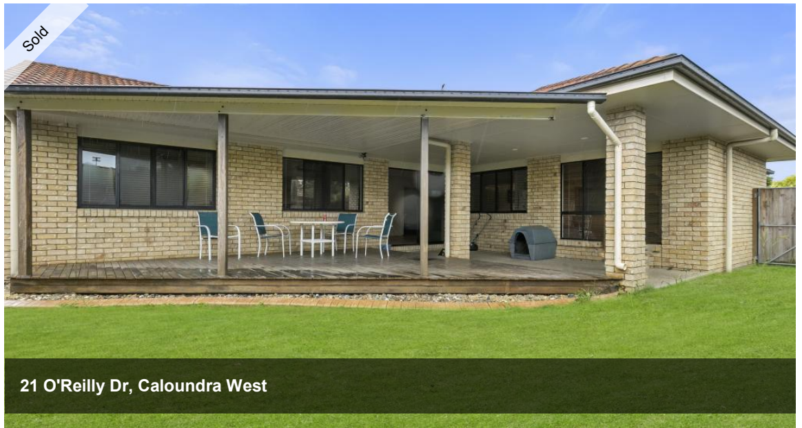
21 O'Reilly Dr, Caloundra West