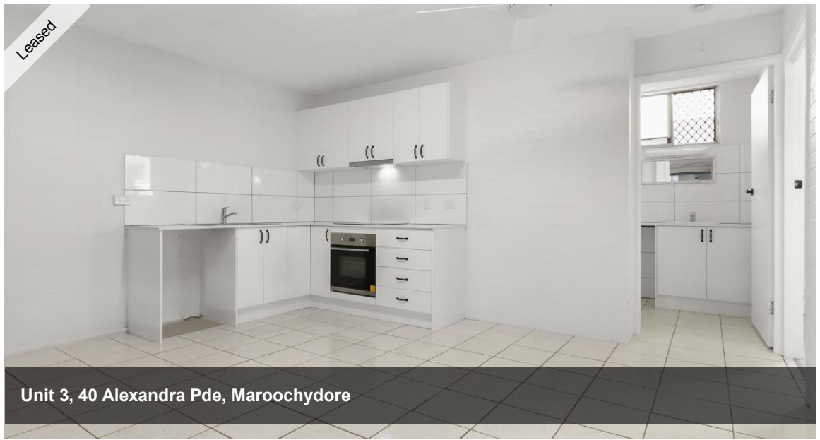
Unit 3, 40 Alexandra Pde, Maroochydore