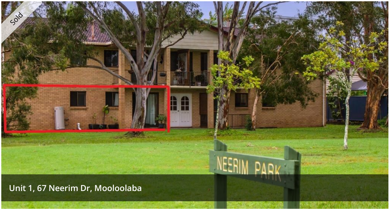
Unit 1, 67 Neerim Dr, Mooloolaba