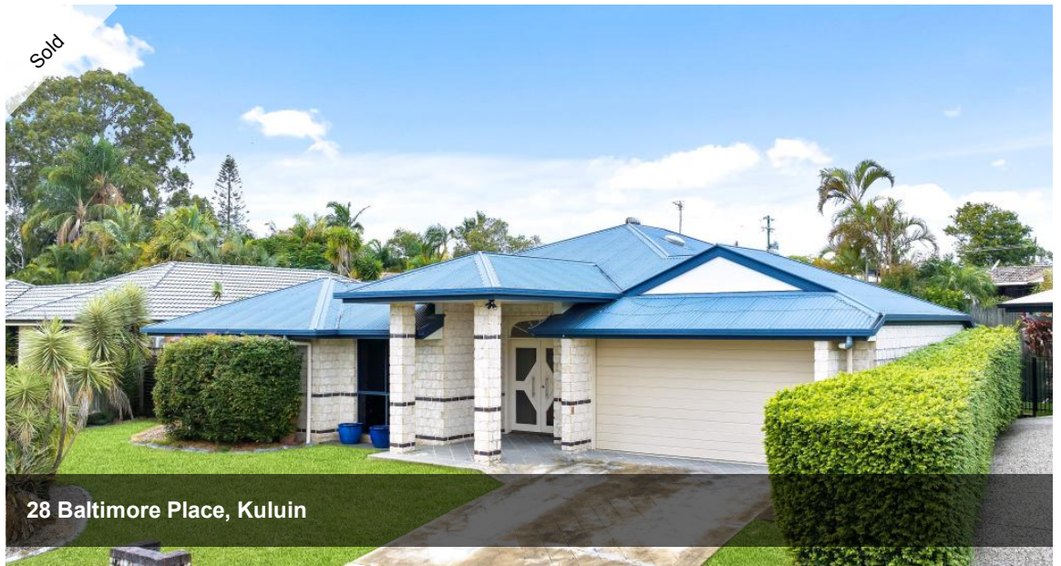
28 Baltimore Place, Kuluin