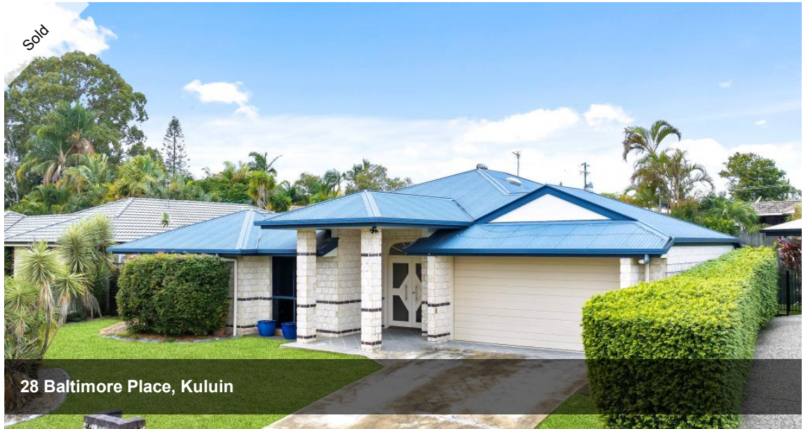
28 Baltimore Place, Kuluin