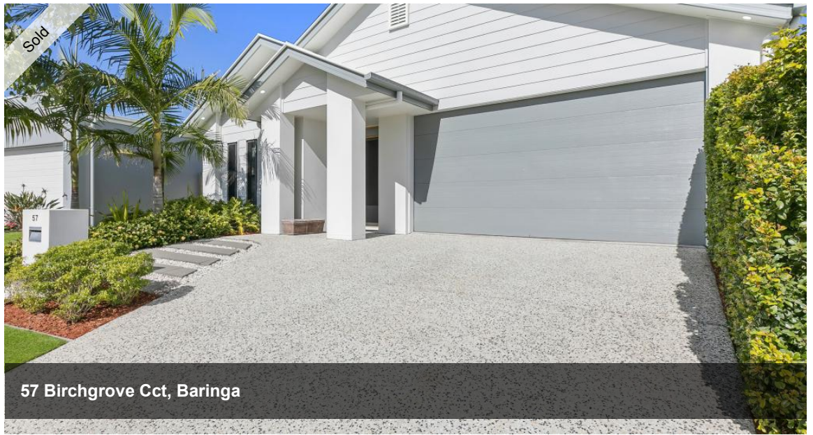
57 Birchgrove Cct, Baringa