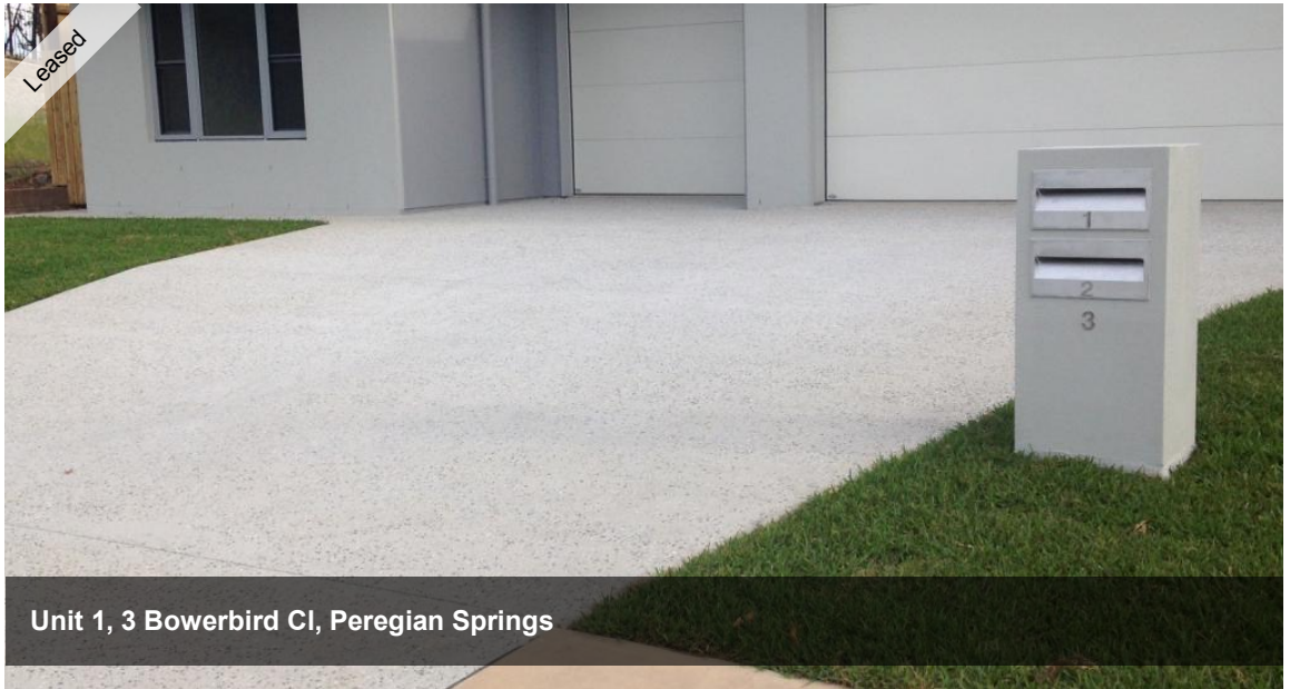
Unit 1, 3 Bowerbird Cl, Peregian Springs