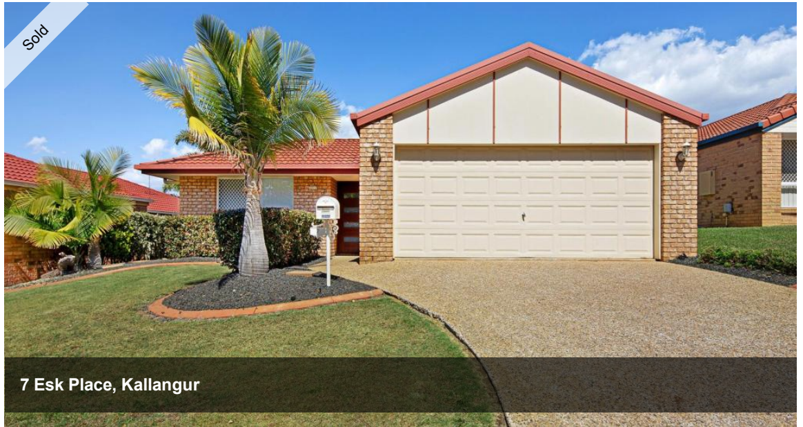
7 Esk Place, Kallangur