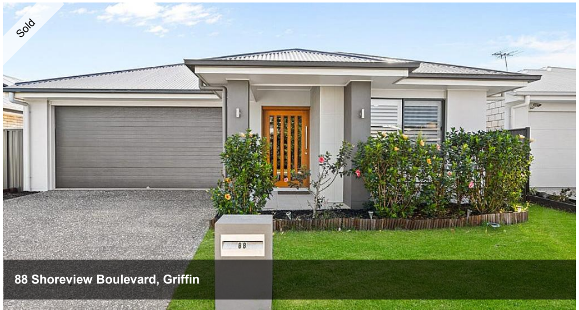
88 Shoreview Boulevard, Griffin