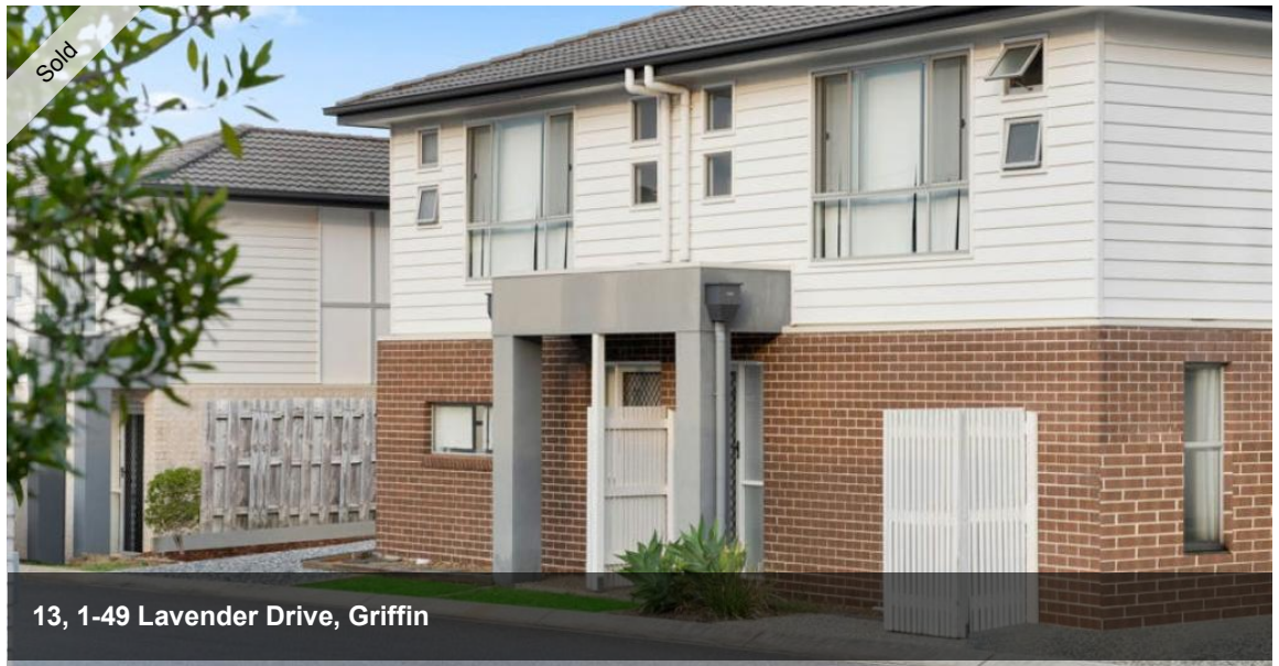
13, 1-49 Lavender Drive, Griffin