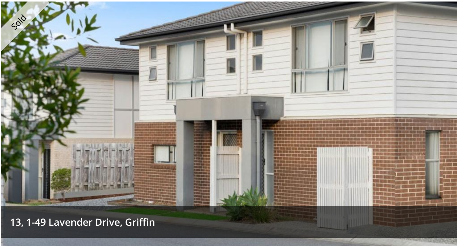
13, 1-49 Lavender Drive, Griffin