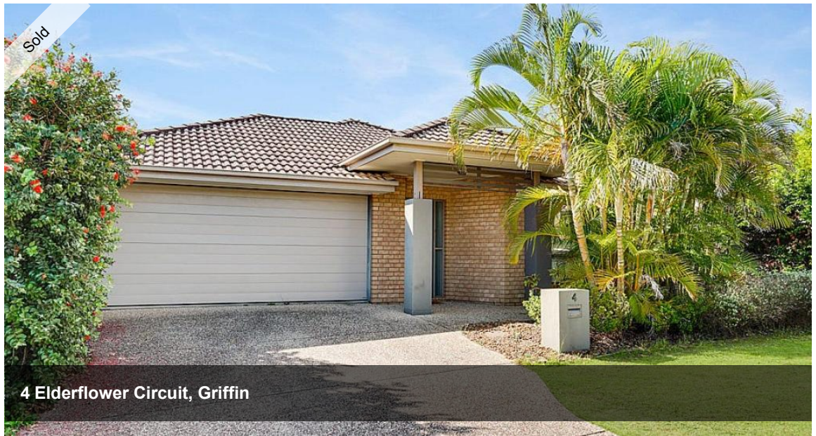
4 Elderflower Circuit, Griffin