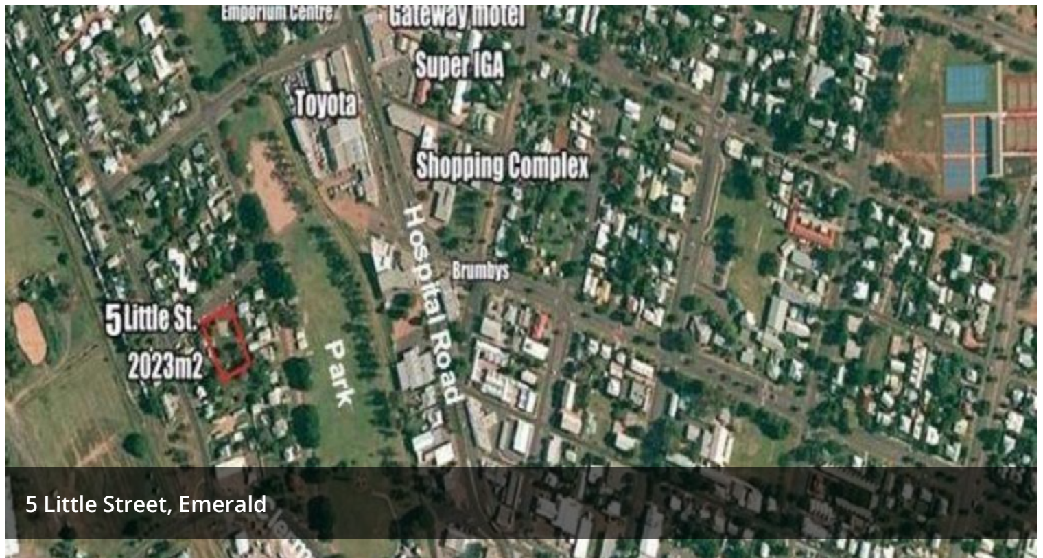
5 Little Street, Emerald